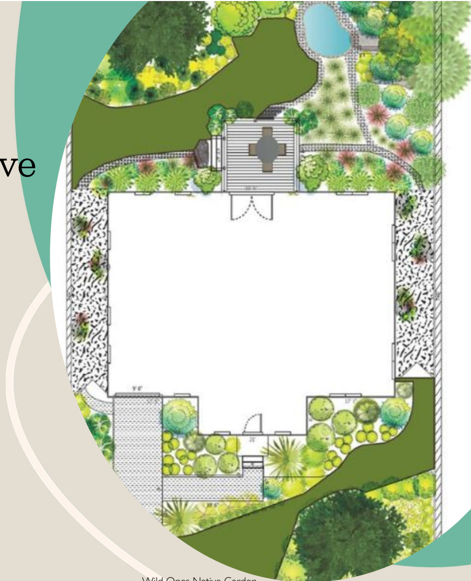
Wild Ones Native Garden free design for Boston area